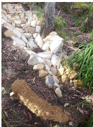
Connaught Road South

Areas bordering natural areas within the catchment have been visited and serious weed threats noted and mapped by weed type, priority and location. The information has been recorded in a spreadsheet and GIS. Blue Mountains City Council (BMCC) has been advised of priority sites.