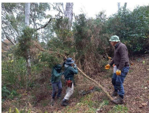
Bushcare Volunteers at Golf Course

GLCG is concerned that the resources and work dedicated to these areas is undermined by the lack of weed control on the golf course immediately downstream.