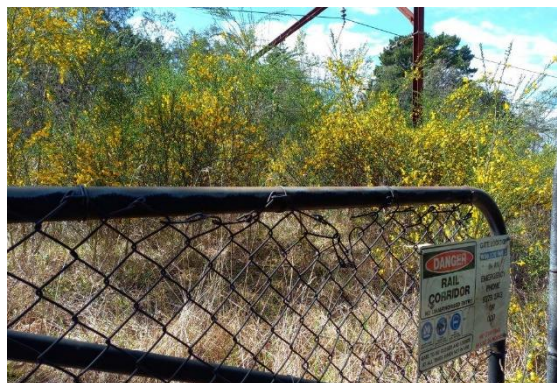
Broom in Rail Corridor

GLCG is very conscious of the weed threat posed by uncontrolled weeds along the Western Railway and Great Western Highway corridor and considers that the obvious presence of weeds along this corridor undermines and renders difficult BMCC efforts to encourage responsible weed management amongst local landholders and sets a bad example to the wider community.