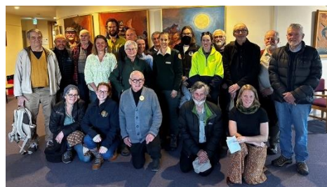
Combined Catchment Groups Meeting

The GLCG Coordinator instigated a combined catchment group forum hosted by BMCC on 19 July 2023 to facilitate liaison with other Blue Mountains catchment groups and identify matters of mutual interest and possible strategies for action.